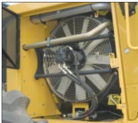
Efficient, high capacity cross-flow cooling.