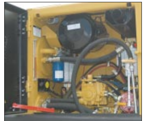
Hydraulic compartment is separated from the engine compartment.