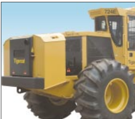
Excellent visibility to the rear tires.