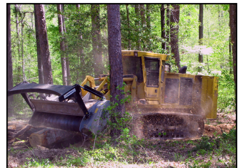
Built for demanding applications and extreme duty cycles