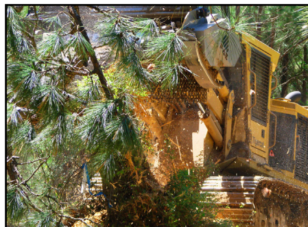
High lift boom system for excellent production in challenging terrain