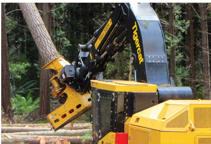
High torque 340° wrist for increased versatility and reduced machine travel.