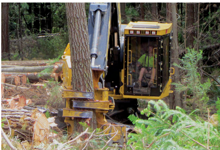
Excellent cutting performance and control of oversize, high value timber.