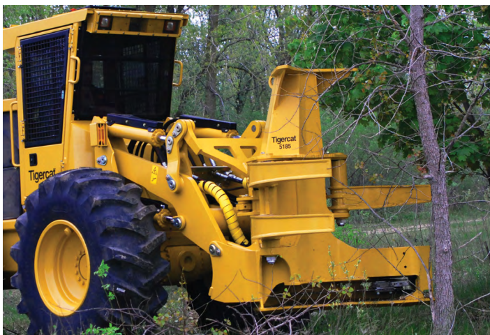
Well matched to the high performance of Tigercat wheel and track carriers.