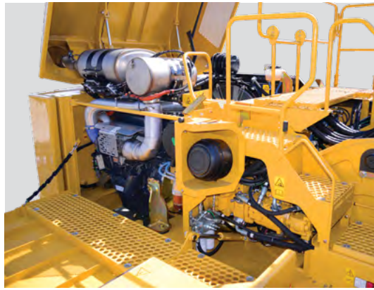
The engine and hydraulic pumps are compartmentalized and accessible.