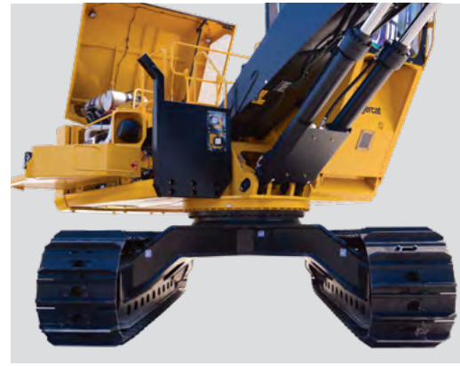
Longer 10 roller frame and wide stance carbody mean excellent stability and durability.