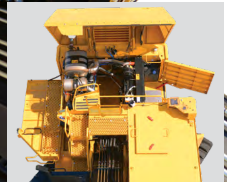
Power operated side door and roof enclosure; neat clean component layout.

THERE IS PLENTY OF ROOM TO WORK IN THE ENGINE COMPARTMENT. CAB ENTRY IS EASY AND CONVENIENT. With a thoughtful layout, the engine compartment is arranged for optimal cooling airflow and easy access to components. Routing of wiring and hoses is tidy and organized.