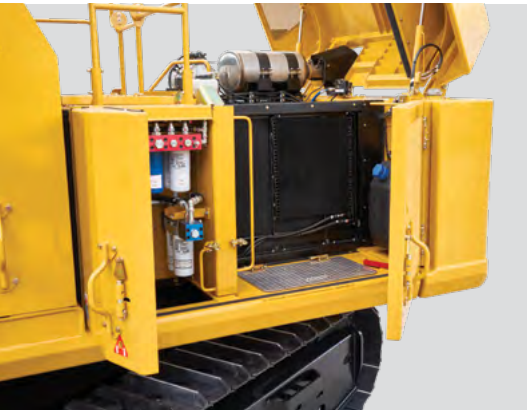
Swing-out doors for filters and cooling system components.