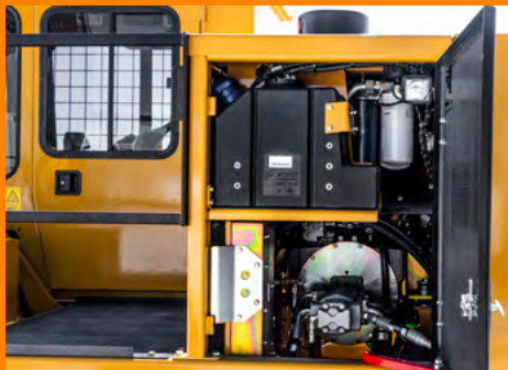
Swing-out door to access hydraulic pumps and filters.