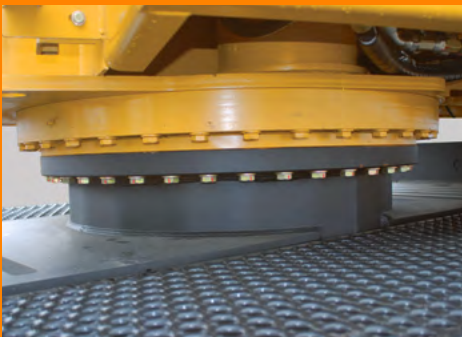
Large diameter swing bearing.